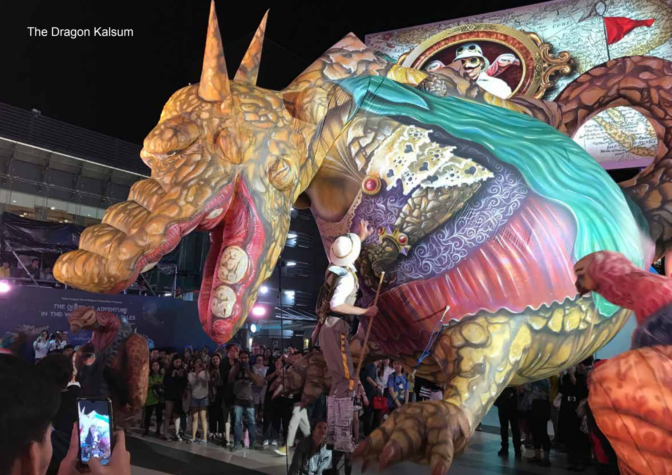
The Dragon Kalsum