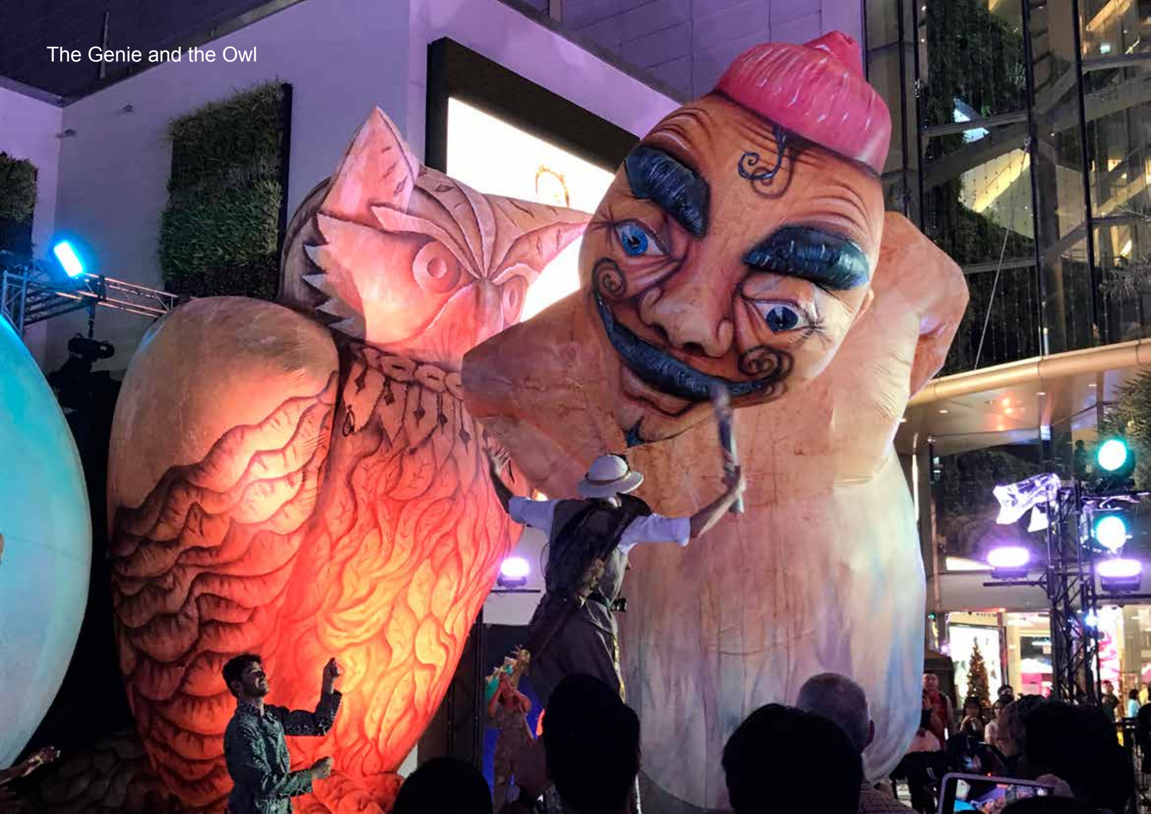
The Genie and the Owl